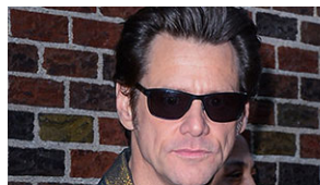
Tough news for struggling Jim Carrey