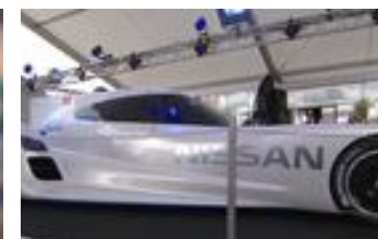
A First Look at the World's Fastest Electric