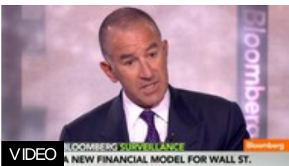
Wall Street Disrupters: The Rise of Boutique Firms