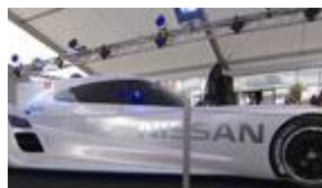
A First Look at the World's Fastest