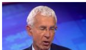
Laszlo Birinyi on Investment Strategy,