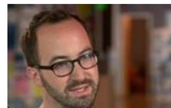
Pixar Shorts: 6 Months of Work Becomes 6:40