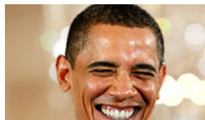
Economist: Prepare for Massive Wealth