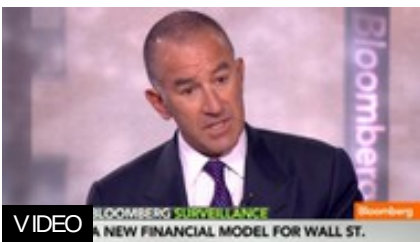
Wall Street Disrupters: The Rise of Boutique Firms

BASSETERRE, St. Kitts (AP) — A Dubai-based real estate company has started construction on a new Hyatt resort in St. Kitts where investors will be eligible for island citizenship.