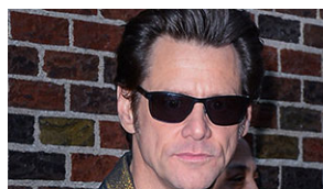
Tough news for struggling Jim Carrey