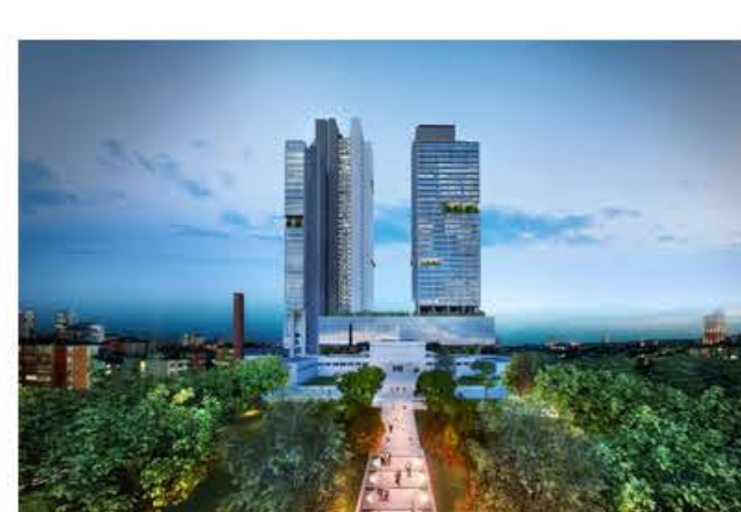
Fairmont Quasar, Istanbul