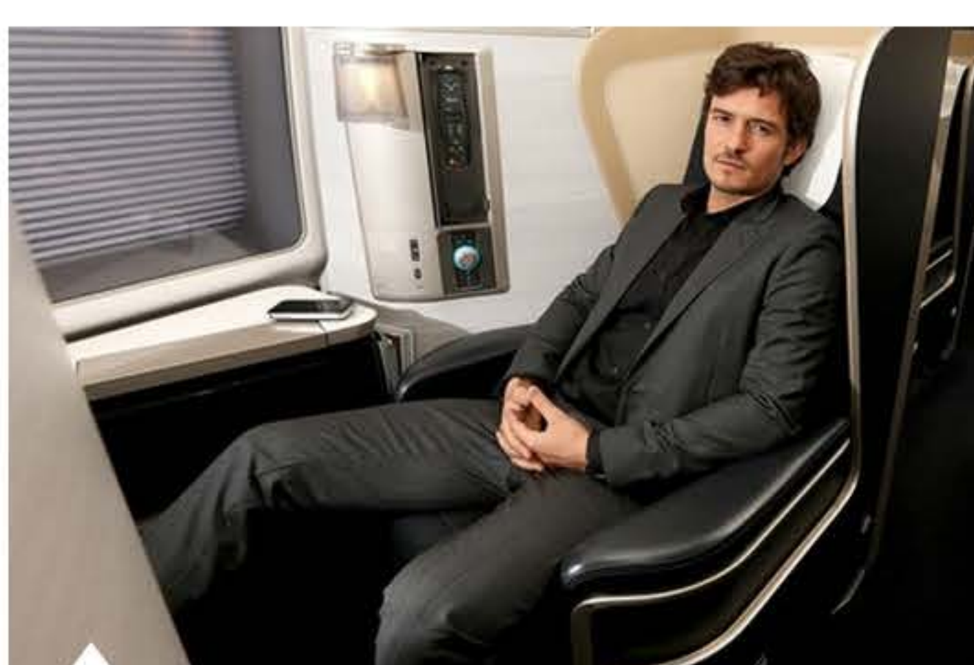
Orlando Bloom: My life in travel