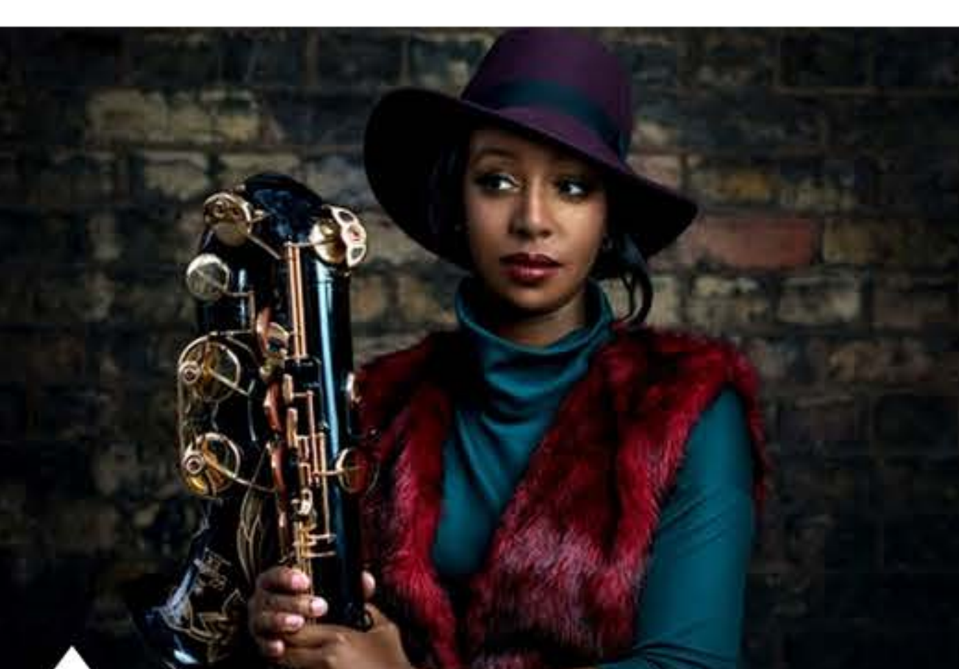
YolanDa Brown: Britain's best jazz venues