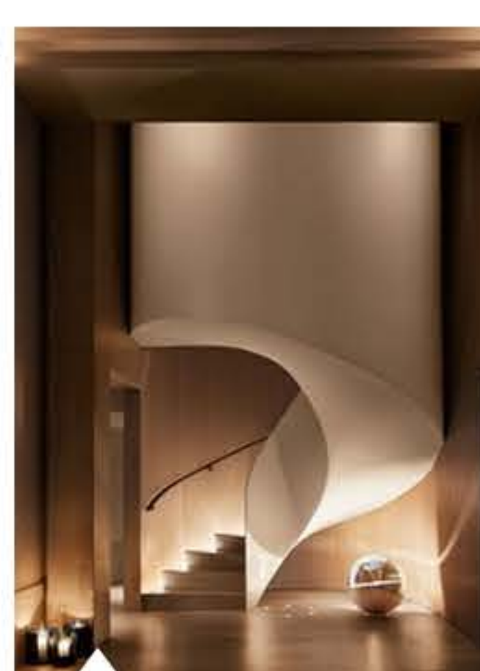
New York: The New York Edition