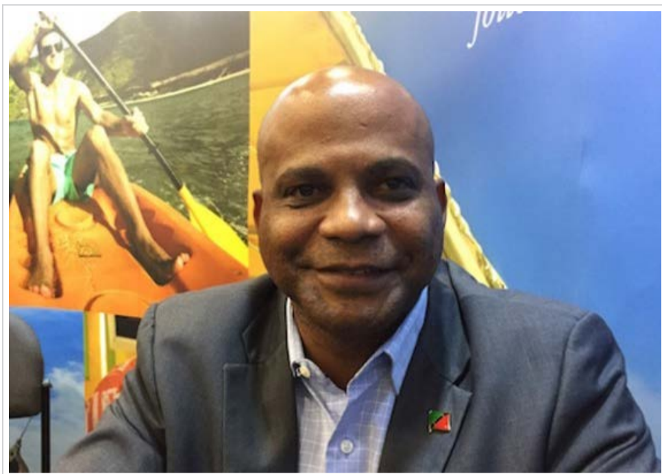
Above: St Kitts and Nevis Tourism Minister