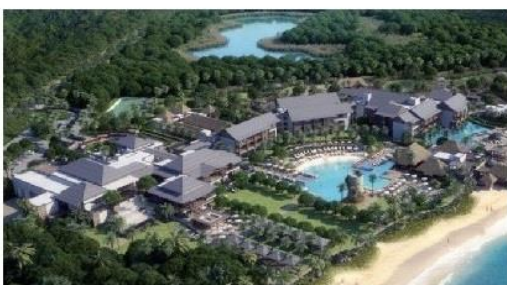
Park Hyatt St Kitts Christophe Harbour

“You have a Park Hyatt, you have a Four Seasons, you have a Marriott – three branded hotels – as well as a number of well-leading independent hotels, which really put you in a unique position compared to some of your peers, and we need to capitalize on that to have future growth in the economy,” he added.