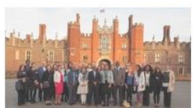
St. Kitts Tourism Authority meets with British travel agents October 19, 2017 In "news"

St. Kitts: Final Hurricane tourism update St. Kitts is pleased to report that initial assessments have been completed and the island is resuming normal operations, as it was fortunate to escape major September 22, 2017 In "editorial"