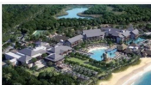
Park Hyatt St Kitts Christophe Harbour is the first Park Hyatt hotel in the Caribbean

BASSETERRE, St. Kitts – Park Hyatt St Kitts Christophe Harbour, a five-star luxury beach resort that opened this month in the heart of Banana Bay with 300 local permanent employees, has propelled St. Kitts and Nevis into a unique position within the Caribbean tourism industry.